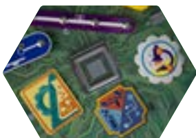
STEM Career Exploration Badges

This expanded badge line now includes content for all Girl Scout levels