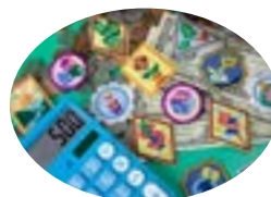
Financial Literacy Badges

This newly updated badge line is modernized for all levels.