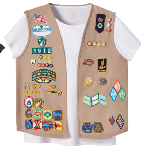
Cadettes Grades 6-8

Need more help? Go to girlscouts.org/placement .