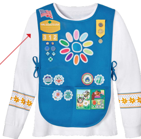
Daisies Grades K-1

Fun patches from trips and experiences always go on the back.