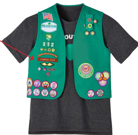
Juniors Grades 4-5