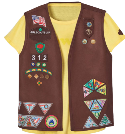
Brownies Grades 2-3