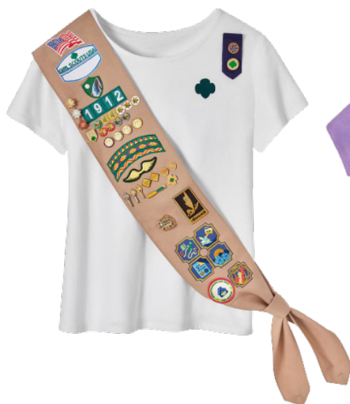
Seniors Grades 9-10

Need more help? Go to girlscouts.org/placement .