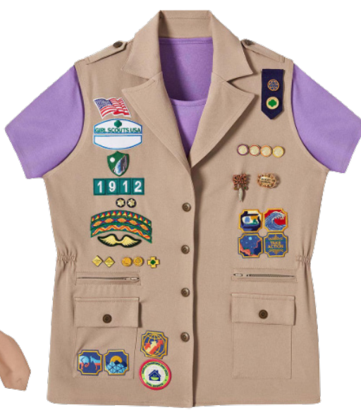
Ambassadors Grades 11-12